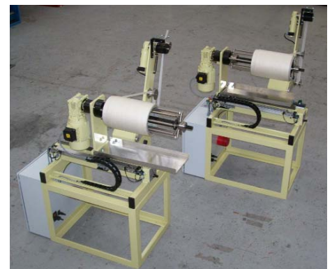
ALPHATRIM – simple, cost effective way to wind edge trims.