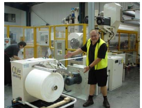
ALPHATRIM – first day in operation; it worked straight out of the box.